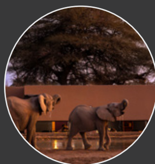
Lala Limpopo Sleep out Hide